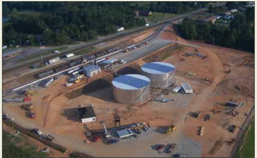
Sloan Construction's New Union County Asphalt Facility

constructing an aggregate mine in Cherokee County ($15 million investment near town of Blacksburg, SC) and is in the final stages of getting a liquid asphalt facility in Union County ($6.5 million dollar investment) ready for production. Sloan anticipates the Cherokee investment to add 40 new workers to their payroll and the Union investment to add five.